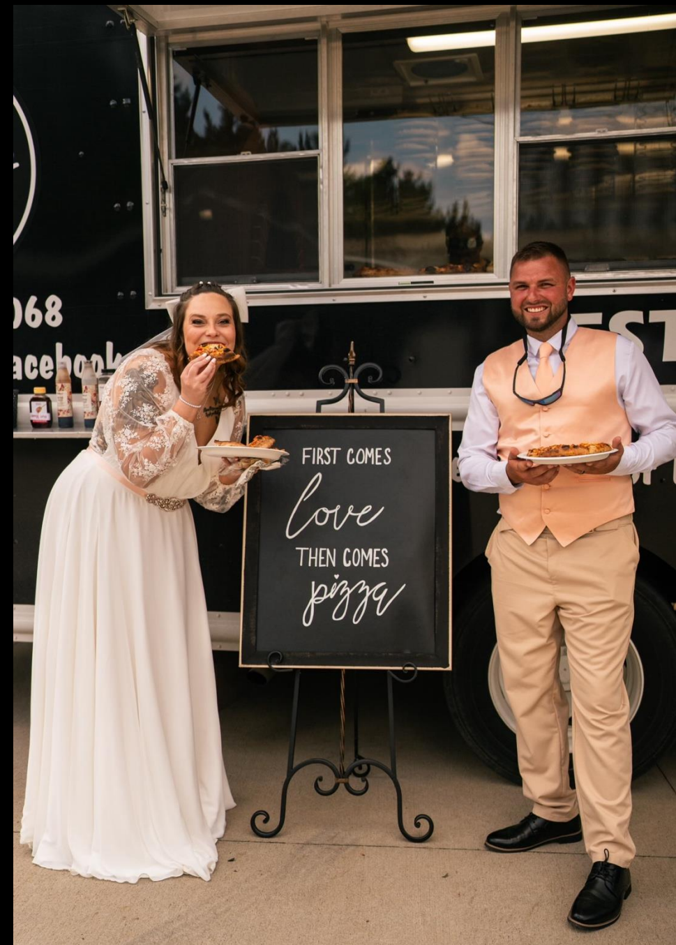
Food Truck Catering