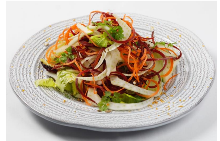
Radicchio and Little Gem