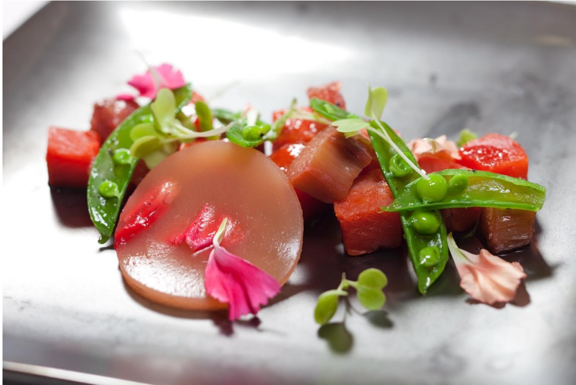
Cured Sockeye Salmon with Rhubarb Gelee