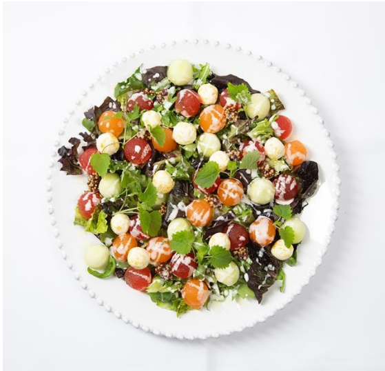
Lavender and Melon