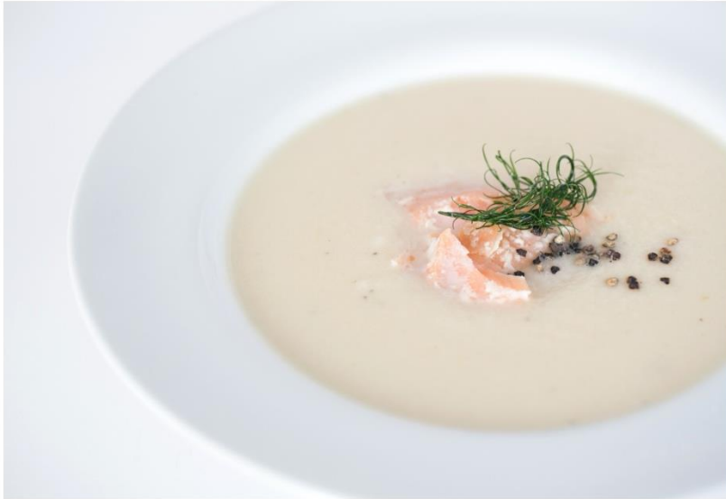
Cauliflower with Smoked Salmon