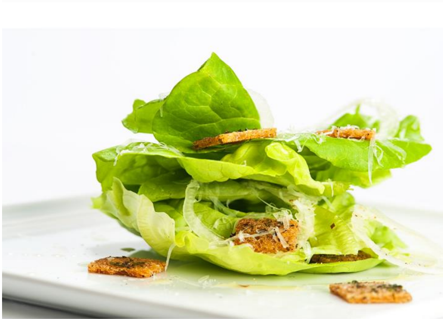
Layered Boston Salad