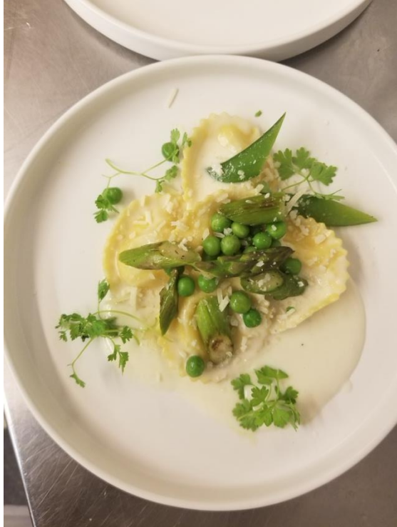
Buffalo Mozzarella with spring peas