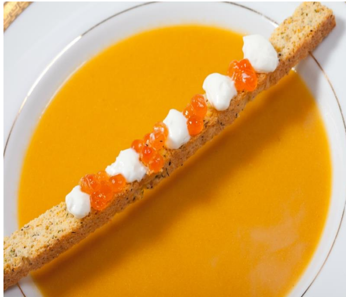
Carrot Turmeric Soup