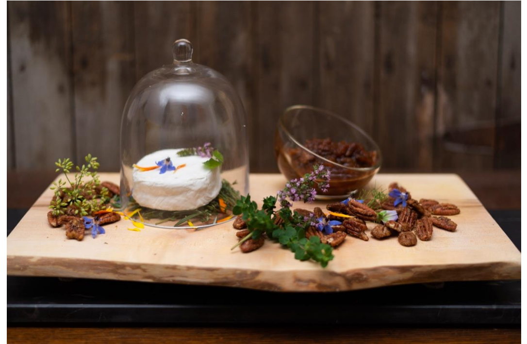
Smoked Cheese and Salad Course