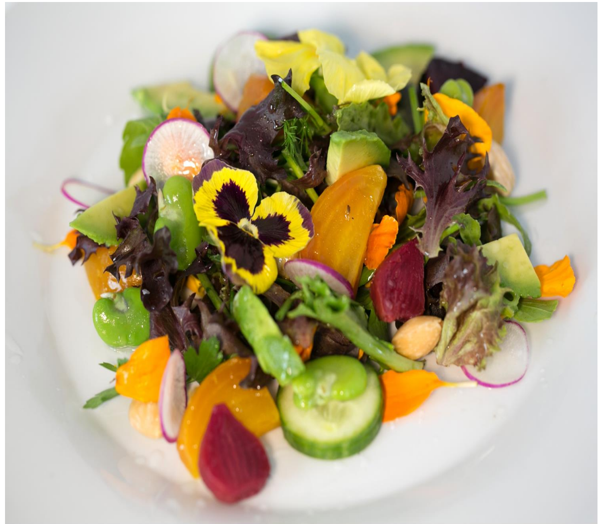
Summer Herb and Beet