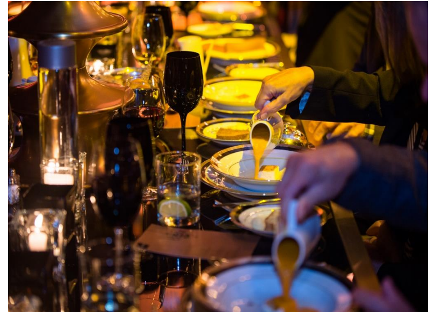
Roasted Red Pepper Velouté With a savory Chili Marshmallow