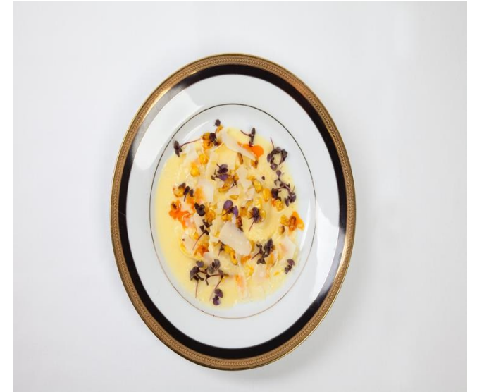
Grilled Summer Corn Ravioli