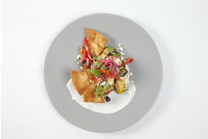
Zucchini Fattoush Salad