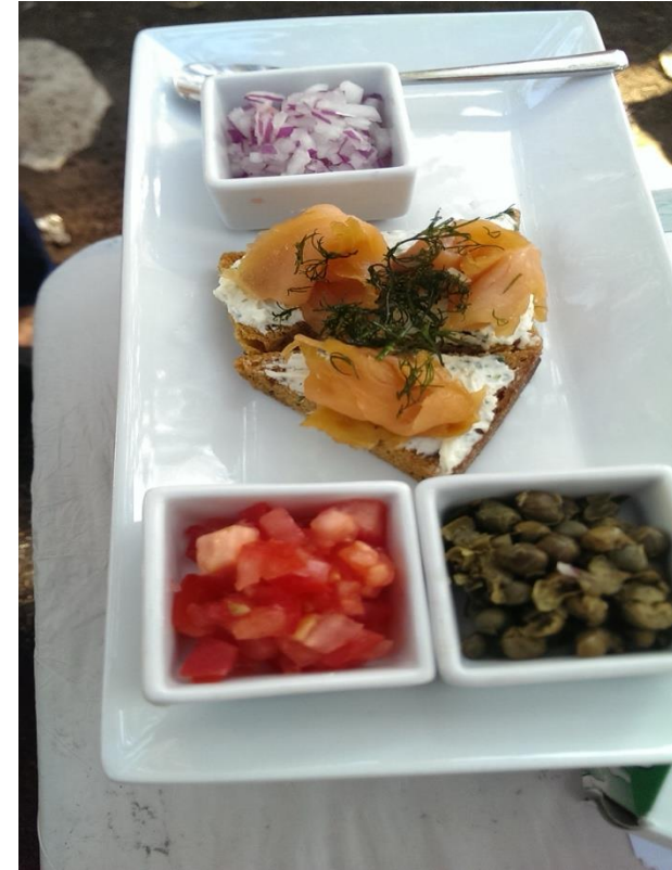
Multigrain Smoked Salmon