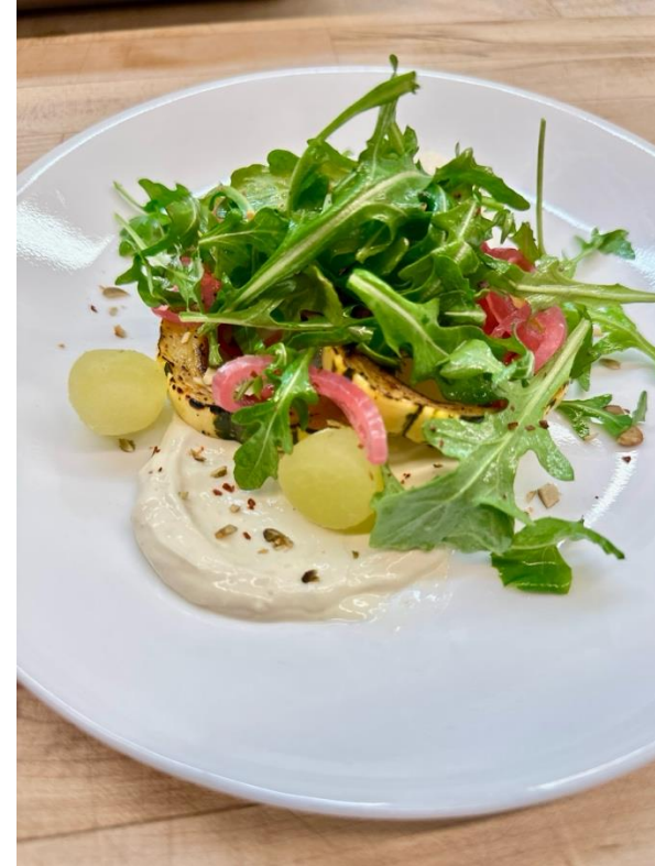
Roast Delicata Squash and Vegan Cheese Salad