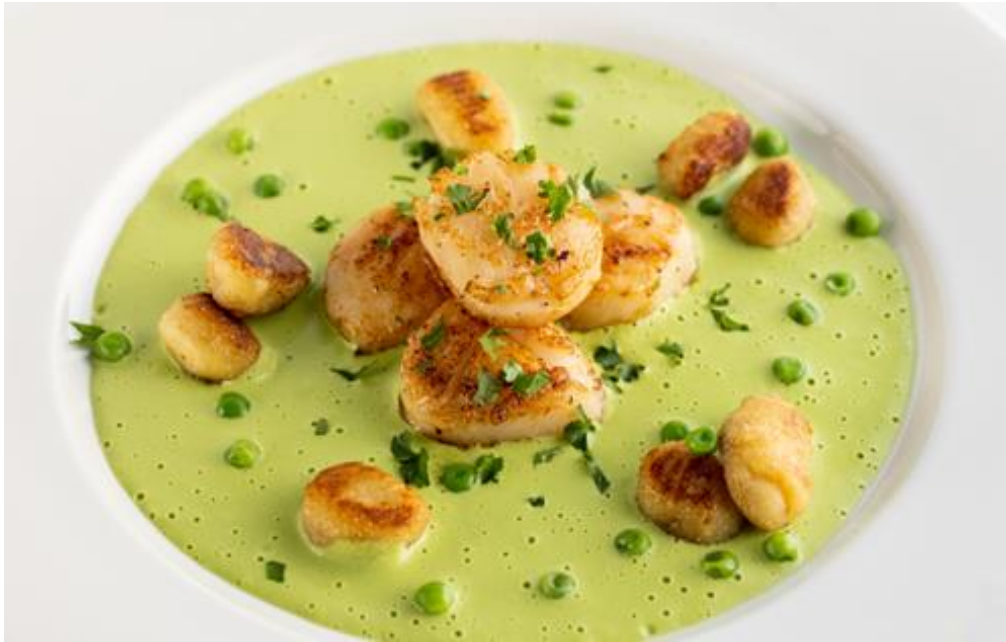
Gnocchi & Scallops