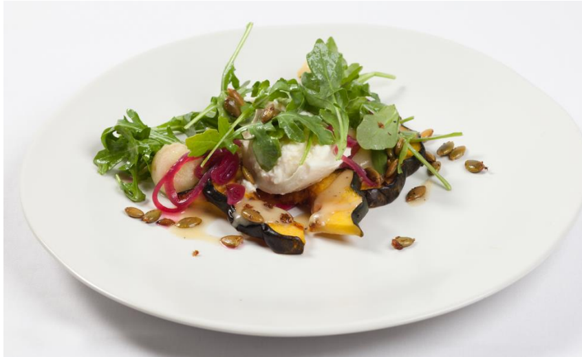
Roast Delicata Squash and Burrata Salad