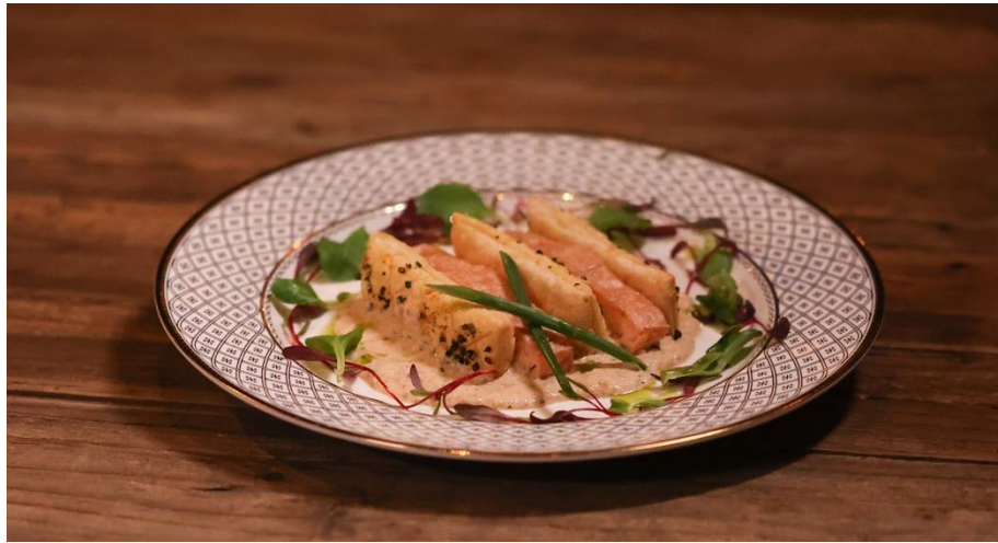
Smoked Salmon Phyllo