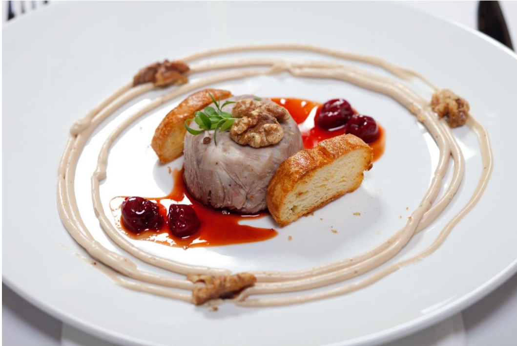
Duck Rilette with Sour Cherry