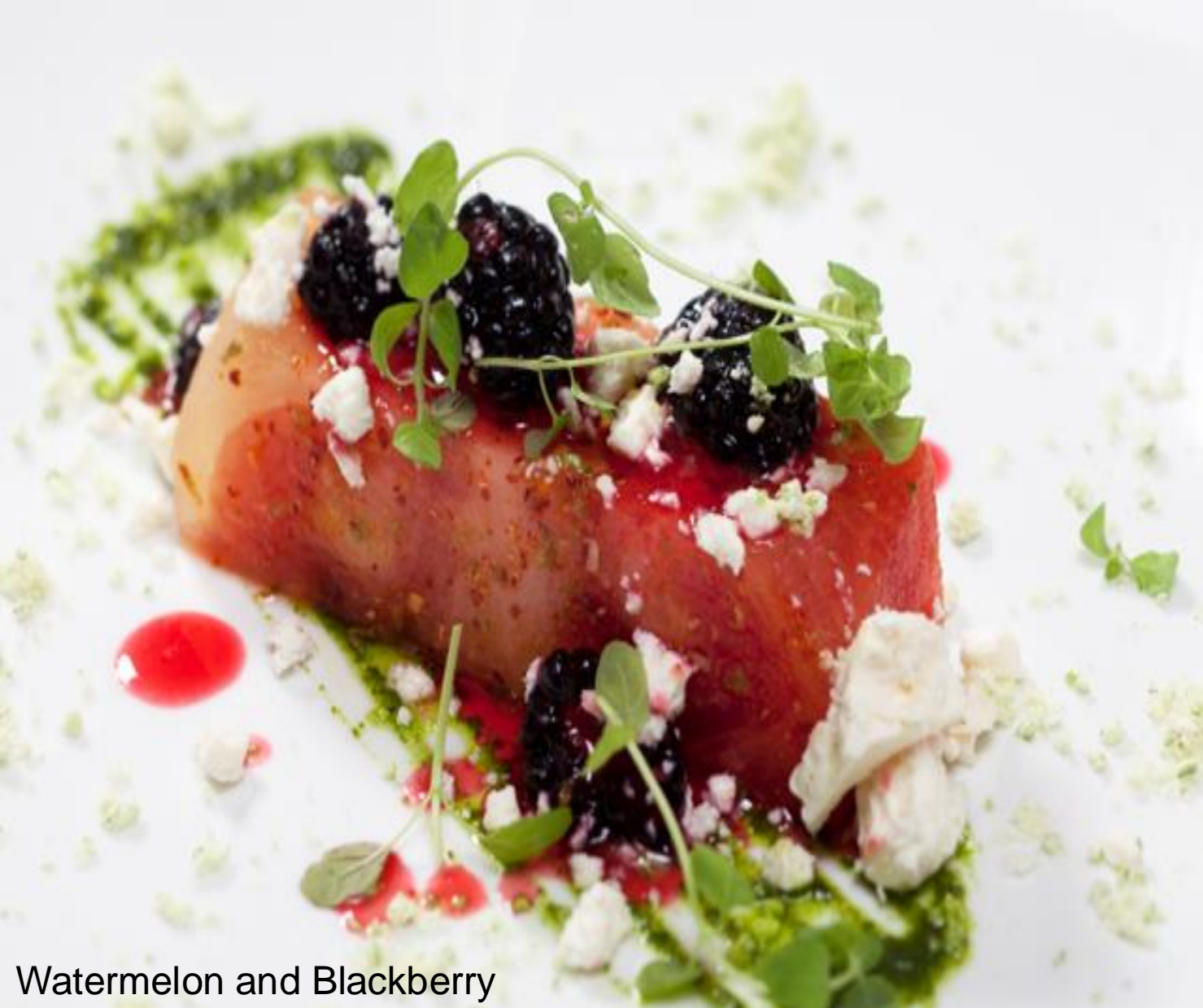
Watermelon and Blackberry