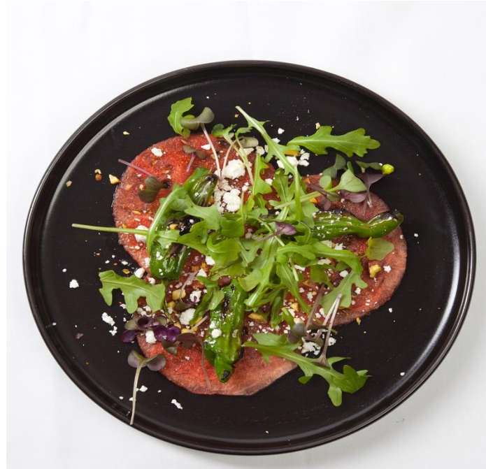
Watermelon Carpaccio with Shishito Peppers and Feta