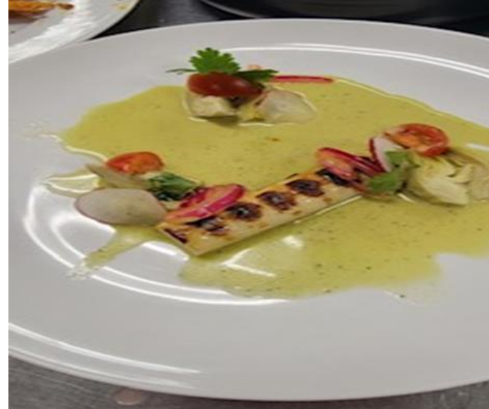
Heart of Palm and Artichoke