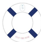
custom beach buoy