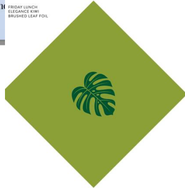
3.5" WOODEN LASERCUT PLACE CARD

Sunday Brunch 10am-12noon The Lagoon & outside patio Resort Casual Attire