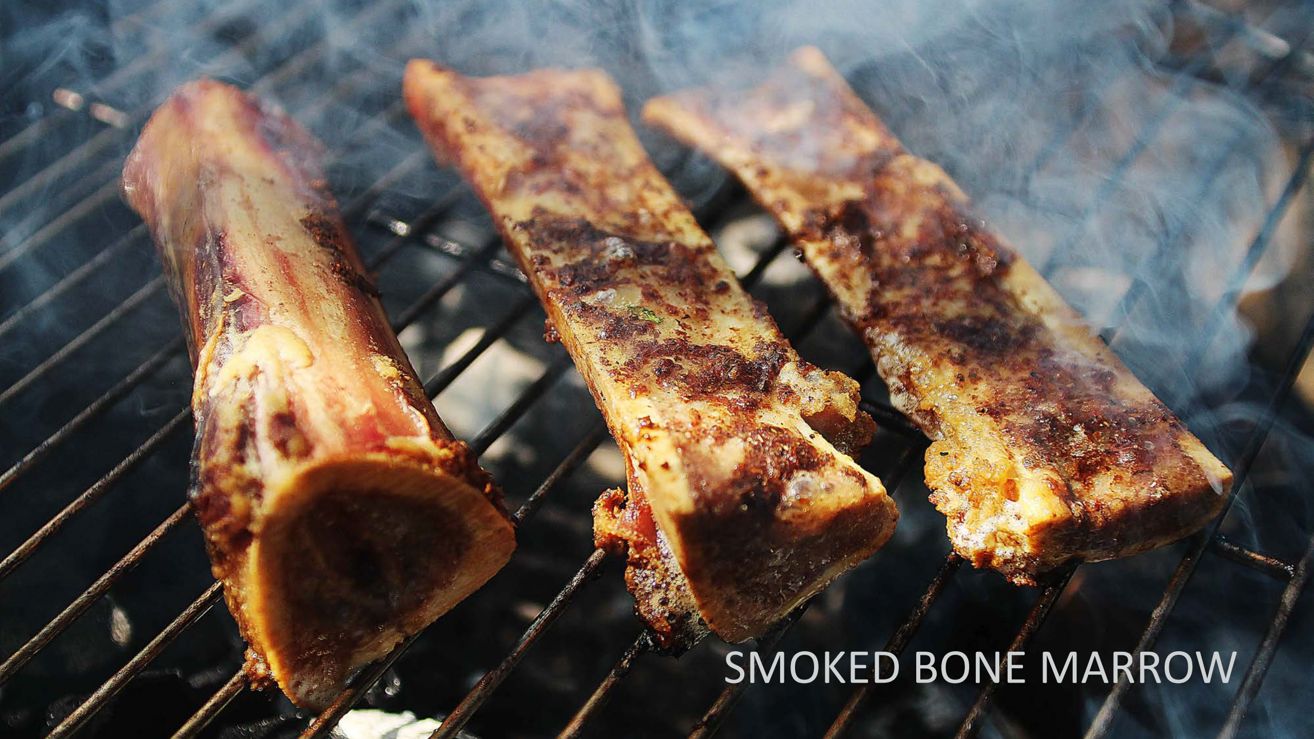
SMOKED BONE MARROW