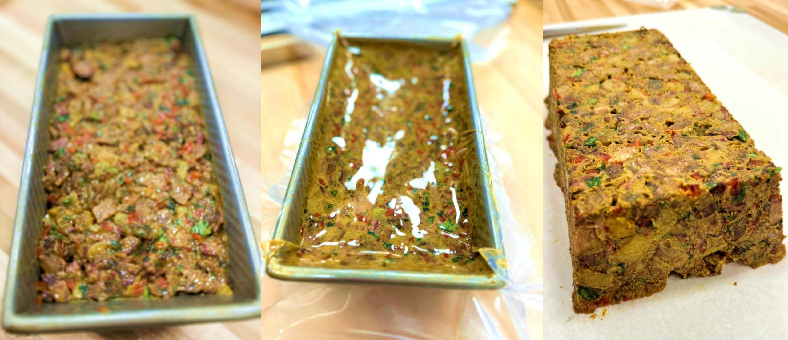
MOROCCAN BRISKET TERRINE