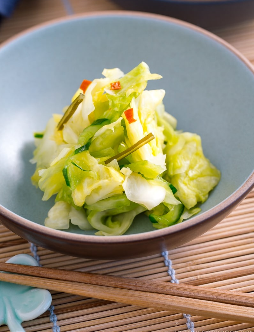
tsukemono cabbage pickles