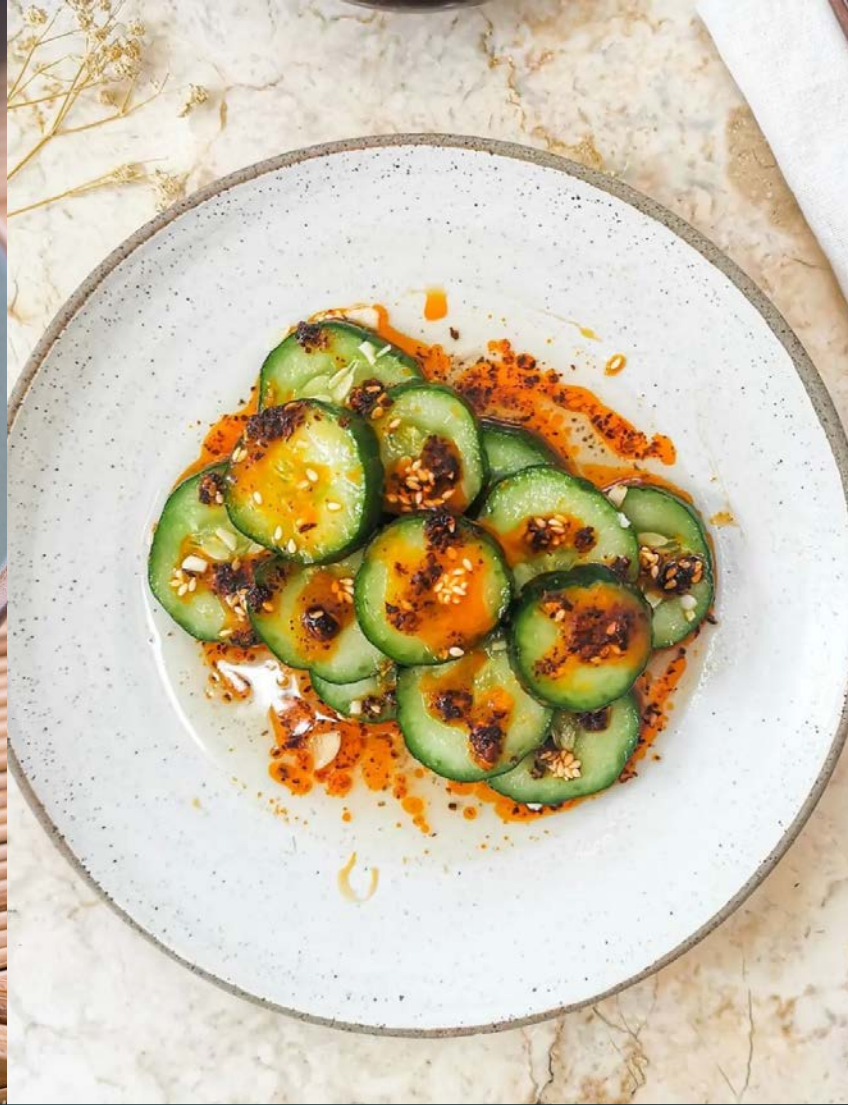
chili crunch sunomono