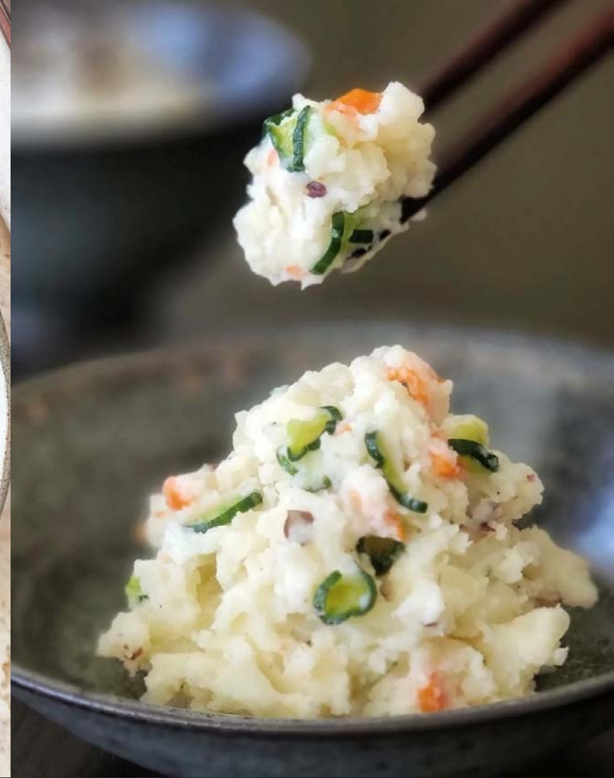
japanese potato salad